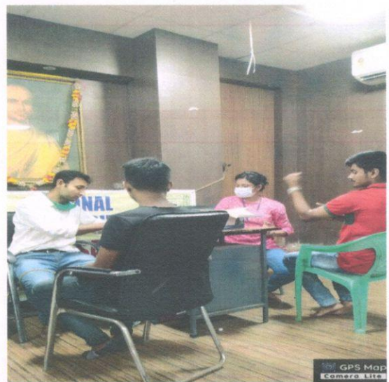
33, Bidhan Sarani, Taltala, Simla, Machuabazar, Kolkata, West Bengal 700006, India

Latitude 22.582553029060364° Longitude 88.36717307567596° Local 03:51:47 PM Altitude -47.6 meters GMT 10:21:47 AM Friday, 22-04-2022