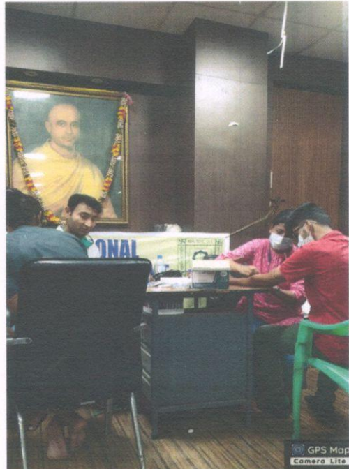
33, Bidhan Sarani, Taltala, Simla, Machuabazar, Kolkata, West Bengal 700006, India

Latitude 22.582461833953857° Longitude 88.36724817752838° Local 02:33:42 PM Altitude -47 meters GMT 09:03:42 AM Friday, 22-04-2022