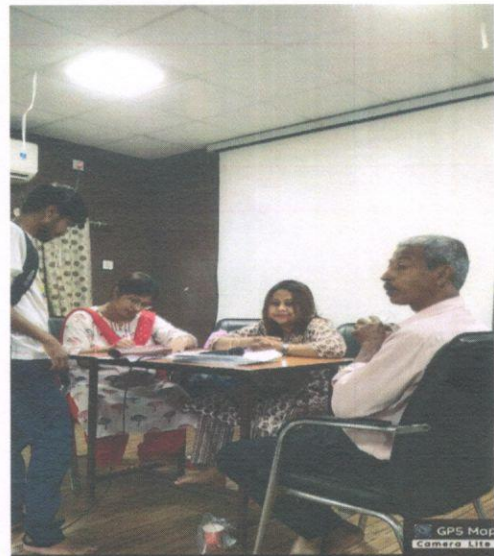
H9J8+XV5, Sankar Ghosh Ln, Simla, Machuabazar, Kolkata, West Bengal 700006, India

Latitude 22.5825448° Longitude 88.3671754° Local 04:00:46 PM Altitude -47.6 meters GMT 10:30:46 AM Friday, 22-04-2022