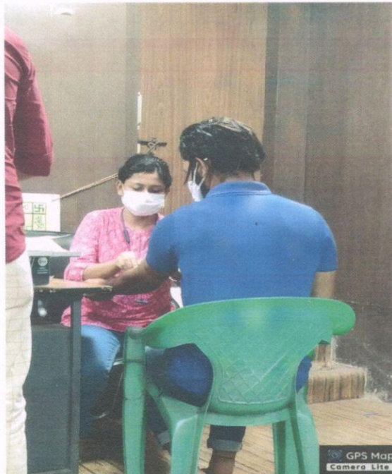
H9J8+XV5, Sankar Ghosh Ln, Simla, Machuabazar, Kolkata, West Bengal 700006, India

Latitude 22.582461833953857° Longitude 88.36724817752838° Local 02:33:42 PM Altitude -47 meters GMT 09:03:42 AM Friday, 22-04-2022