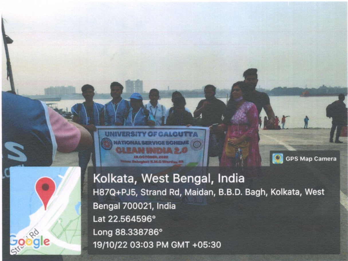
NSS Volunteers of University of Calcutta with NSS Volunteers from Vidyasagar Metropolitan College