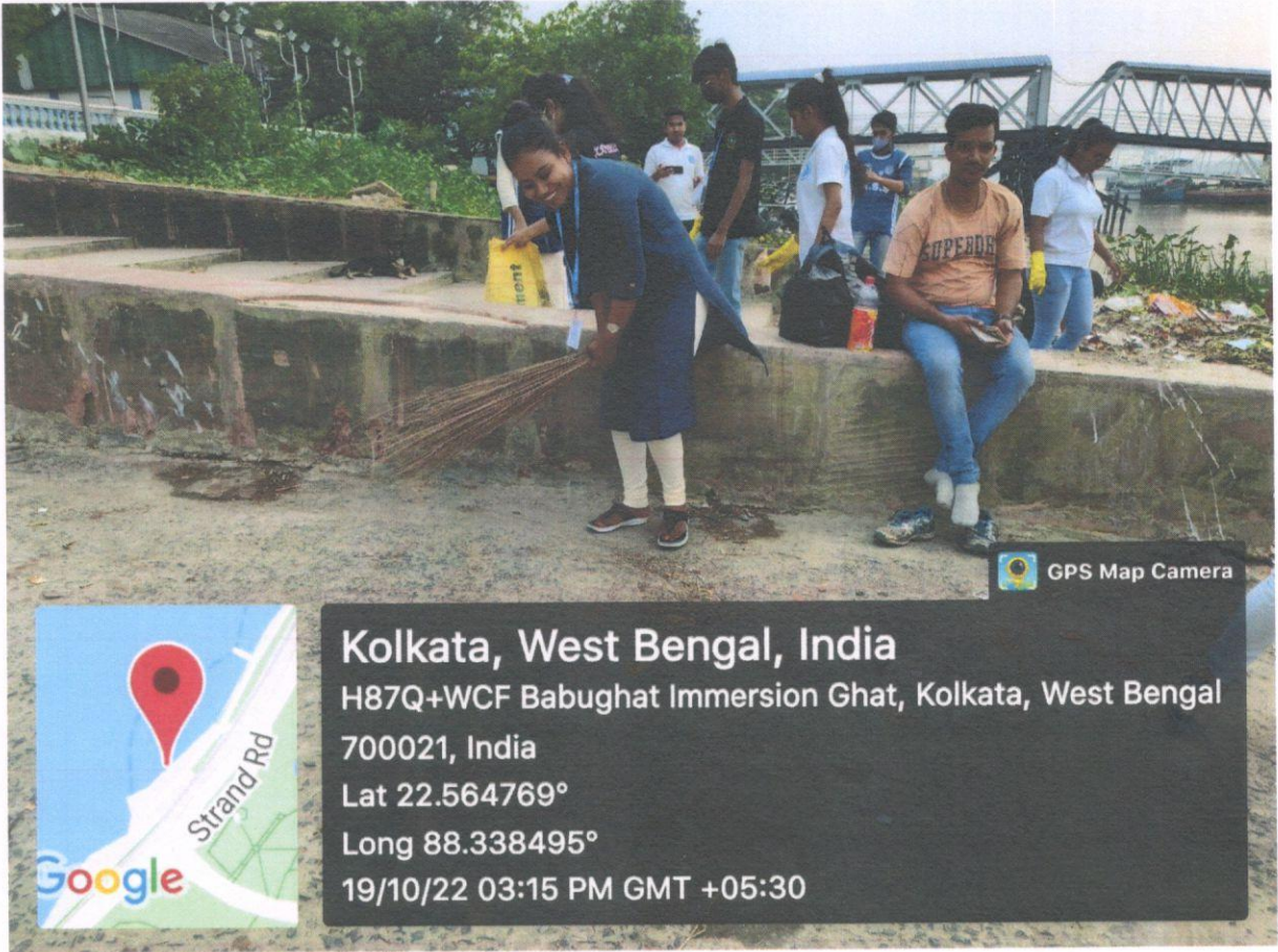
NSS volunteers engaged in cleaning garbage at Babughat, Kolkata

[Handwritten Signature] PRINCIPAL VIDYASAGAR METROPOLITAN COLLEGE KOLKATA-700 006