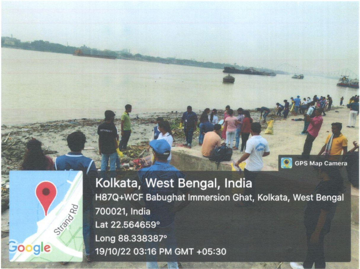
NSS volunteers engaged in cleaning garbage at Babughat, Kolkata